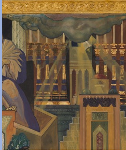
King Solomon's Temple (a detail from the Wilshire Boulevard Temple Murals)

www.standrewskentct.org * 860.927.3486 * st.andrew.kent@snet.net